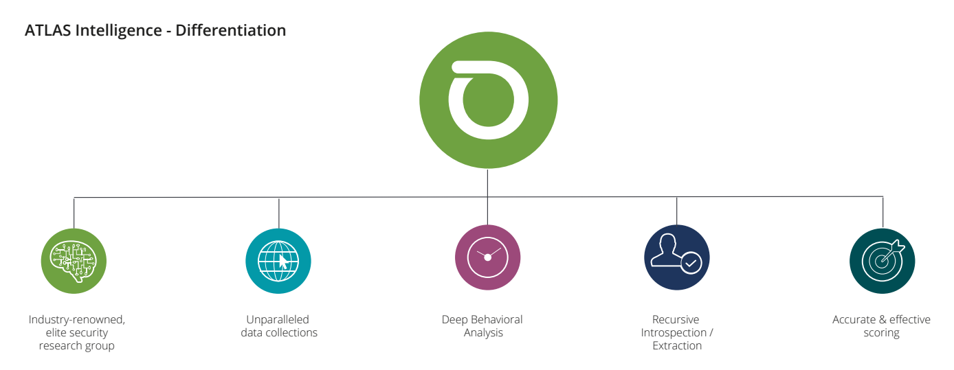
People. Collection. Process

In addition, ASERT applies the notion of Confidence Scoring to each loC. To determine a Confidence Score, ASERT's systems looks at a number of things including overlap with Spam list sources, contacts with sinkhole research servers, as well as lists of parked domains.