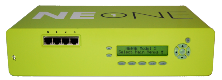
NE-ONE Professional Network Emulator provided the simplicity of use CD PROJEKT RED were looking for

CD PROJEKT RED began looking for their replacement by surveying the emulator market and drawing up a shortlist of potential candidate products. Following a series of discussions and presentations the studio decided the NE-ONE Professional Model 20 was going to be their preferred solution.